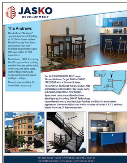
Jasko Development Property Sell Sheet